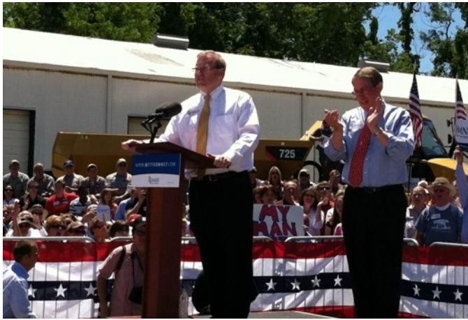
Rep. Morgan Griffith and Rep. Bob Goodlatte address supporters at the Romney Rally